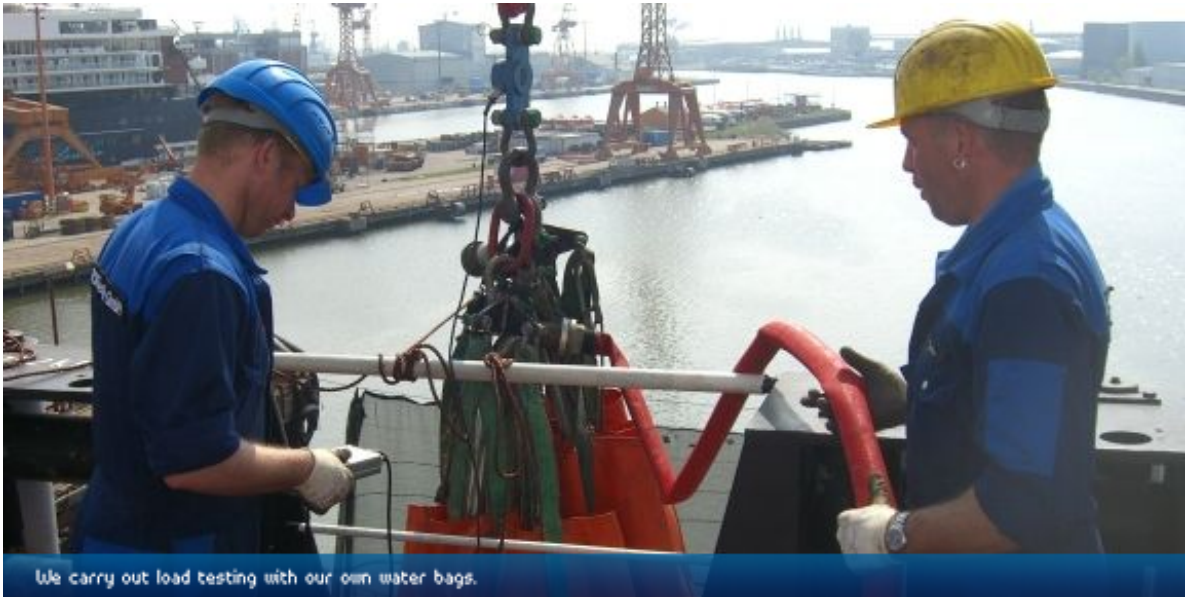
We carry out load testing with our own water bags.